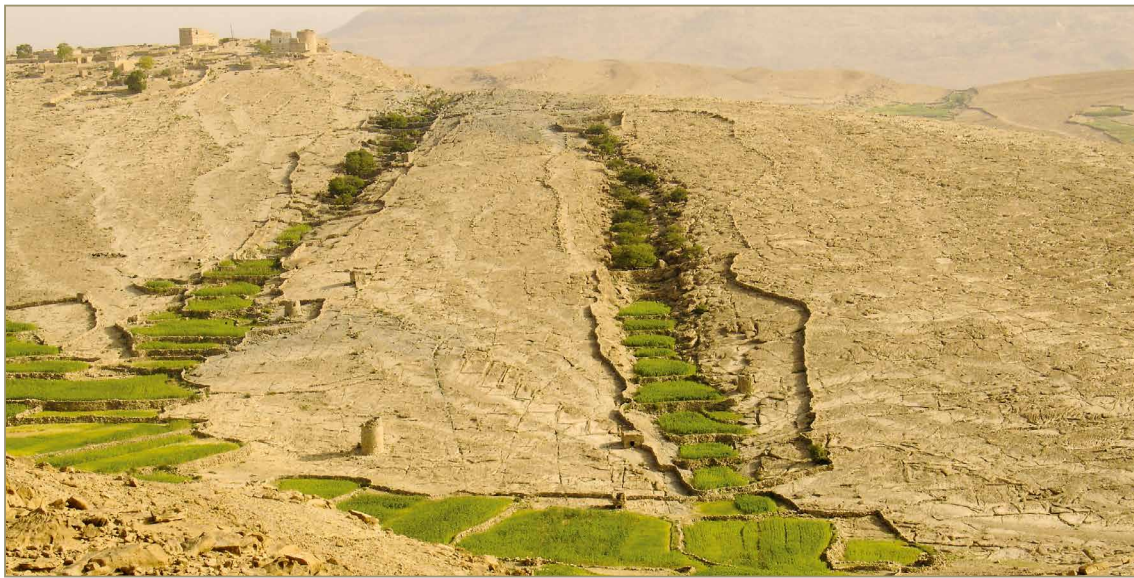
Figure 1. Spate system in Yemen

crude, it ideally suits the need in a spate system to share a very uncertain quantity on the basis of simple rules and quick communication. The outcome (see Figure 1) is an apparently rather uniform distribution of water among users.